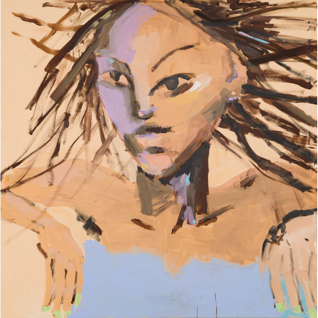
Purple in the Face, 2023 195 x 195 cm Acrylic on canvas SOLD