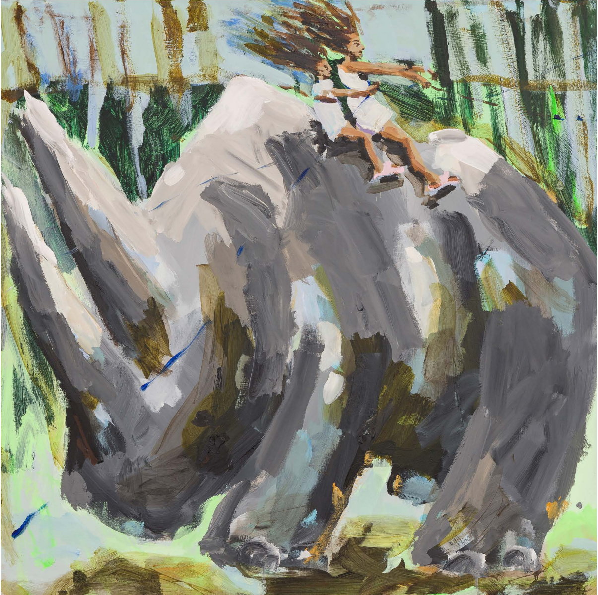
Rightway Rhinoride, 2023 100 x 100 cm Acrylic on canvas SOLD