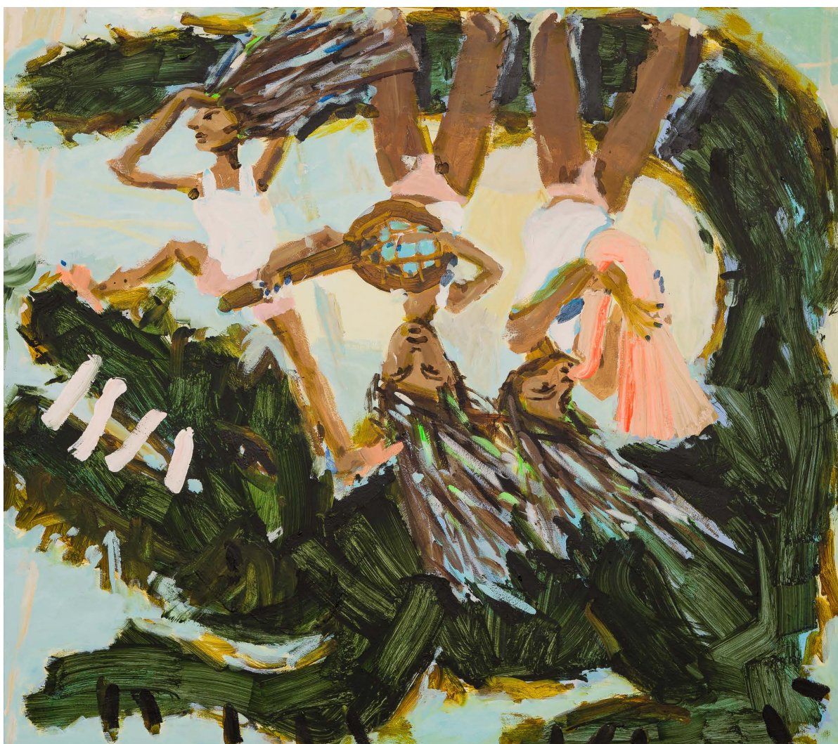
Upside Down - Looking Out, 2023 150 x 170 cm Acrylic on canvas SOLD