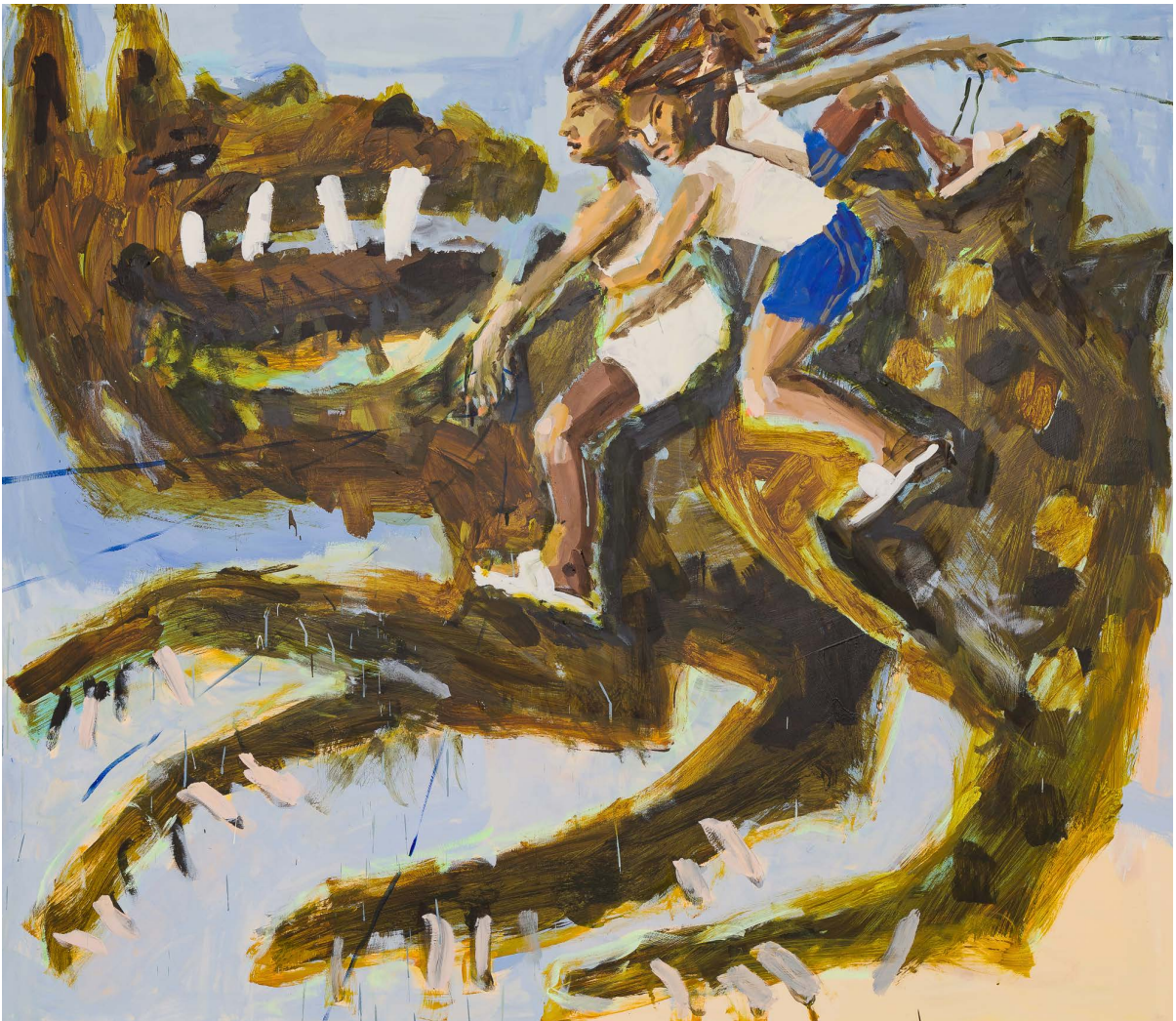
FFWD Freedom Riders, 2023 190 x 220 cm Acrylic on canvas SOLD