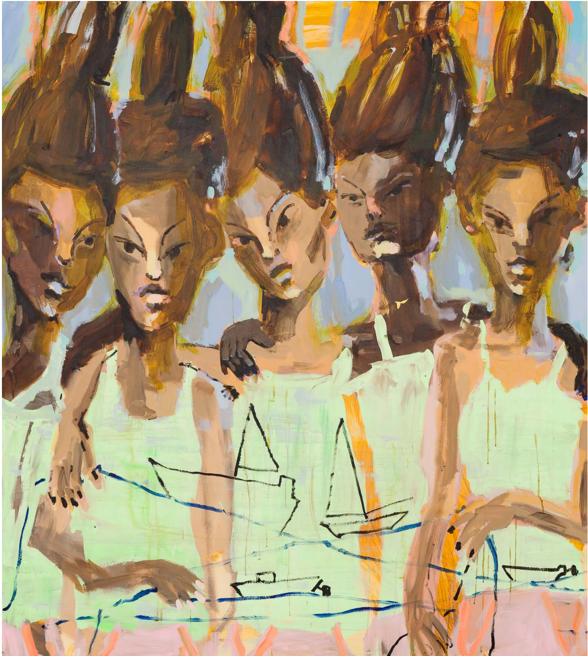
Standing Tall with Ships, 2023 190 x 170 cm Acrylic on canvas SOLD